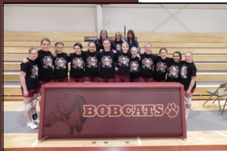
Varsity Volleyball Team

Current staff, students and families are invited to join alumni and friends for a night of fun and fellowship on Monday, December 27 at 7:00 p.m. in Sterling