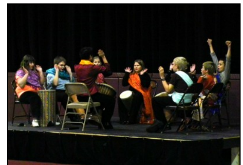
5th-6th Grade Drum Circle

A most generous offering of $1363 for the Creative Arts Fund was collected during the vocal concert on October 21. Thank you for the continued support of the students, school and all of our programs.