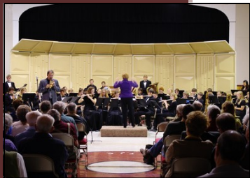
Saxophobia and FA Band

CONGRATULATIONS are in order for 23 of our FA students. These students were selected to be in the Region I Middle and High School Honor Band Festival which will be held in Yankton on Monday, November 22.