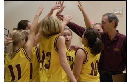
Middle School Girls' Basketball

I would like to thank everyone who helped support our Book Fair. We sold $414 of books and received $206 worth of free books for our library. Our sales were up from last year so our students will enjoy more books for their reading enjoyment.