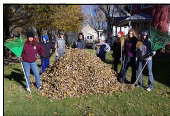
Community Service Day

are here to expose students to a variety of options and activities, but not at the extreme cost of mental and physical health. Every time we suggest