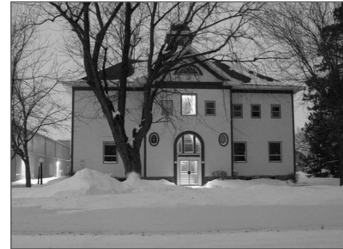
Music Hall 2010

Tickets for the ethnic meal and the musical, Joseph and the Amazing Technicolor Dreamcoat written by Andrew Lloyd Webber and Tim Rice, are still available. Online orders for tickets can be placed at www.schmeckfesttickets.com or by printing an order form at www.freemansd/schmeckfest.com .