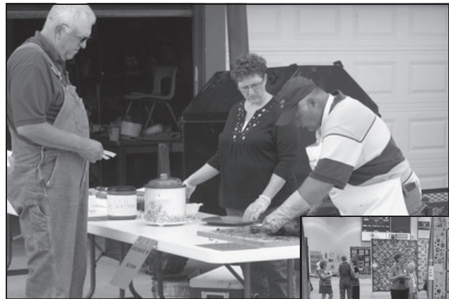
Ribs at the Ranch 2010